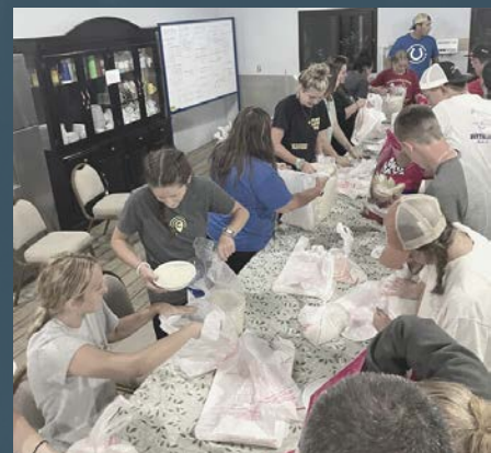
TRIP TO CASA BERNABE